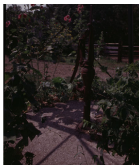
The well