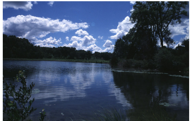
Fountain Lake

This sudden splash into pure wildness - baptism in Nature's warm heart – how utterly happy it made us! John and his brother David settled easily into life on their new farm by Fountain Lake, in Buffalo Township. They loved their pets and farm animals, and discovering the many different birds and creatures. They learned to ride bareback on their Indian pony Jack, and to swim in the lake.