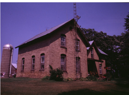
Hickory Hill Farm